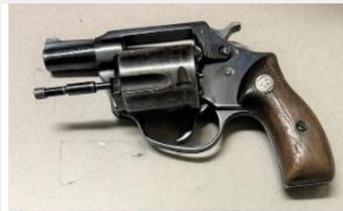
This firearm was detected at a checkpoint by TSA officers at Philadelphia International Airport on December 9.

A West Chester, Pa., man was arrested by police after Transportation Security Administration (TSA) officers at Philadelphia International Airport intercepted a handgun among the man's carry-on items on Monday, December 9. The .38 caliber revolver was loaded with six bullets along with an additional nine bullets for a total of 15 bullets. The firearm was intercepted when the checkpoint X-ray unit alerted a TSA officer of the gun inside the carry-on bag. Police responded to the checkpoint and confiscated the firearm from the man and arrested him on a weapons charge. The man also faces a stiff Federal financial penalty that is likely to run into the thousands of dollars.